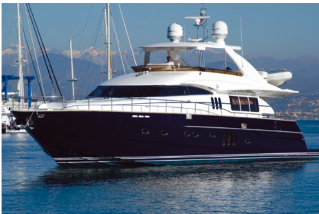
The protection of health and safety is a top priority aboard vessels of all sizes and classes.

It was last September when a deckhand aboard the Saint Mary's Challenger suddenly began suffering chest pains. At the time, the cement freighter was chugging along on Lake Michigan, 33 miles offshore, east of Sheboygan, Wisconsin. He found his way to the pilothouse complaining of pain in his chest, and then collapsed. The captain and first mate, who had both just received training in CPR-AED on the Defibtech Lifeline training unit, grabbed the AED and began to administer treatment. The unit advised not to deliver a shock. Caregivers used the defibrillator to monitor his heartbeat until medical help could arrive. A MedEvac helicopter flew him to Mercy Hospital in Michigan where he underwent surgery for a blockage. Six weeks later, he was back at work. "I'm very, very happy that a Defibtech defibrillator was on board," he said. The AED gave him the peace of mind that he and other crew members had a lifesaving device on board to protect them in case of a cardiac emergency.