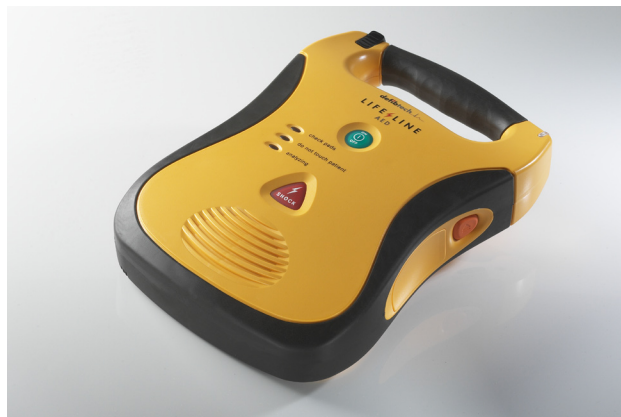
The user-friendly, technologically-advanced, award-winning Defibtech AED.

The Defibtech AED achieved the highest success rate, with 92 percent of participants meeting those criteria. The AED from Philips came in second with an 84 percent success rate, followed by Medtronic and Zoll, each with 72 percent. Cardiac Science trailed the pack with only a 36 percent success rate. While studies like this validate the efficacy and user-friendliness of Defibtech’s AED, other endorsements, awards and accolades continue to roll in: 8